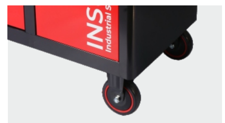
7 Easy Mobility