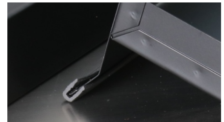
5 Double Hemmed