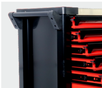
4 Seamless Design