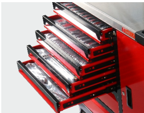
3 Self-Lock Tabs