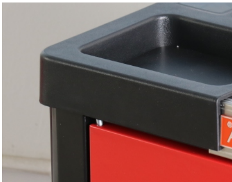
1 Double-walled construction for rigidity