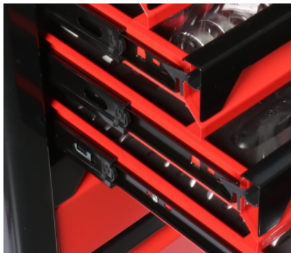
2 High Performance Roller bearing railings