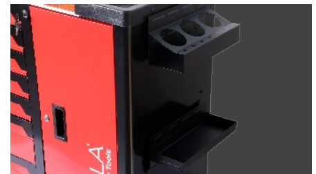
6 Heavy-Duty Construction